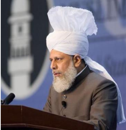
Hazrat Mirza Masroor Ahmad (ABA) Khalifa-tul-Masih V

A Friday Sermon delivered by Hadhrat Khalifatul Masih V on 20 June 2003 at the Fazl Mosque London