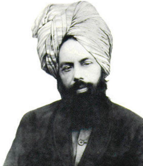
Hazrat Mirza Ghulam Ahmad (AS) of Qadian The Promised Messiah & Mehdi

(Excerpts from the writings of the Promised Messiah (AS))