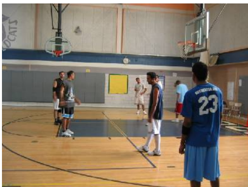
3-on-3 Tournament which was played in Maryland on Thanksgiving day Weekend, 2005