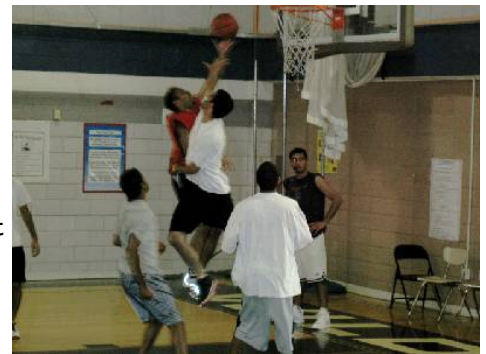
A basketball match in progress during the 3-on-3 tournament

The unique make-up of the teams provided an excellent opportunity for Khuddam to get to know members from other Majalis within the region. With the precedence set, Inshallah , this will become an annually recurring event and more Khuddam will participate in this tournament in the future. The Sports Department wishes to thank all organizers whose hard work led to a successful event. May Allah bless them all and reward them abundantly. Ameen .