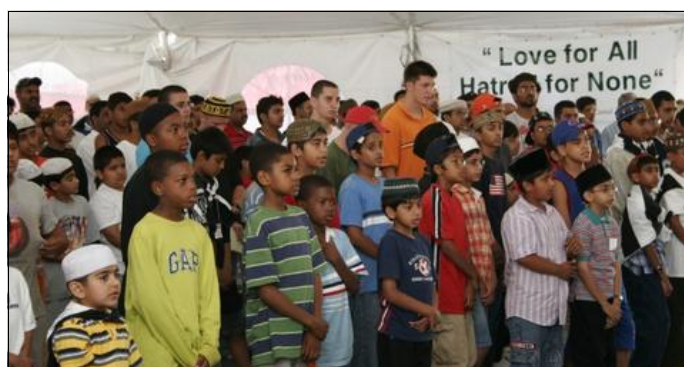
Some attendees at National Ijtema 2005