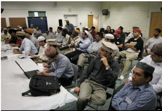
Shura delegates listening to presentation of proposals

Alhamdulillah, Majlis Khuddam ul Ahmadiyya USA held their Shura meeting at Bait ul Hadi in New Jersey on September 17 th 2005 where National Amila members, Qaideen, and Shura delegates gathered to discuss four proposals which were accepted for discussion this year. They were: