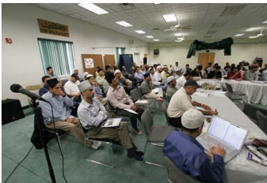
Another view of the Shura delegates

The committees reconvened for another hour and a half after namaz and wrapped up their discussions on the proposals. The afternoon concluded with pres-