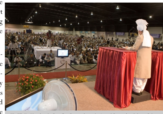
Khalifa V addressing the Canadian Community at the Annual Convention, Jalsa at Calgary