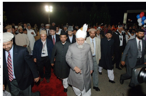
Hadhrat Mirza Masroor Ahmad (aba) - Khalifa V arrives at Baitul Rahman Mosque in DC