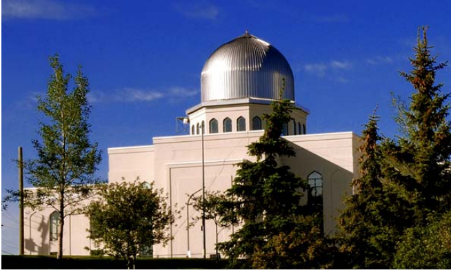
Part of Baitun Nur Mosque in Calgary, Canada - The Biggest Mosque in North America

"We want this mosque to say to the world, 'Please come and join us and together let's make a truly peaceful society in Canada,' "